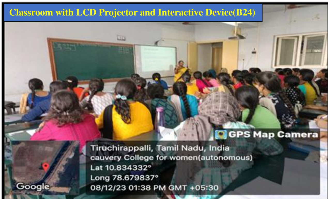
I B. Sc INFORMATION TECHNOLOGY