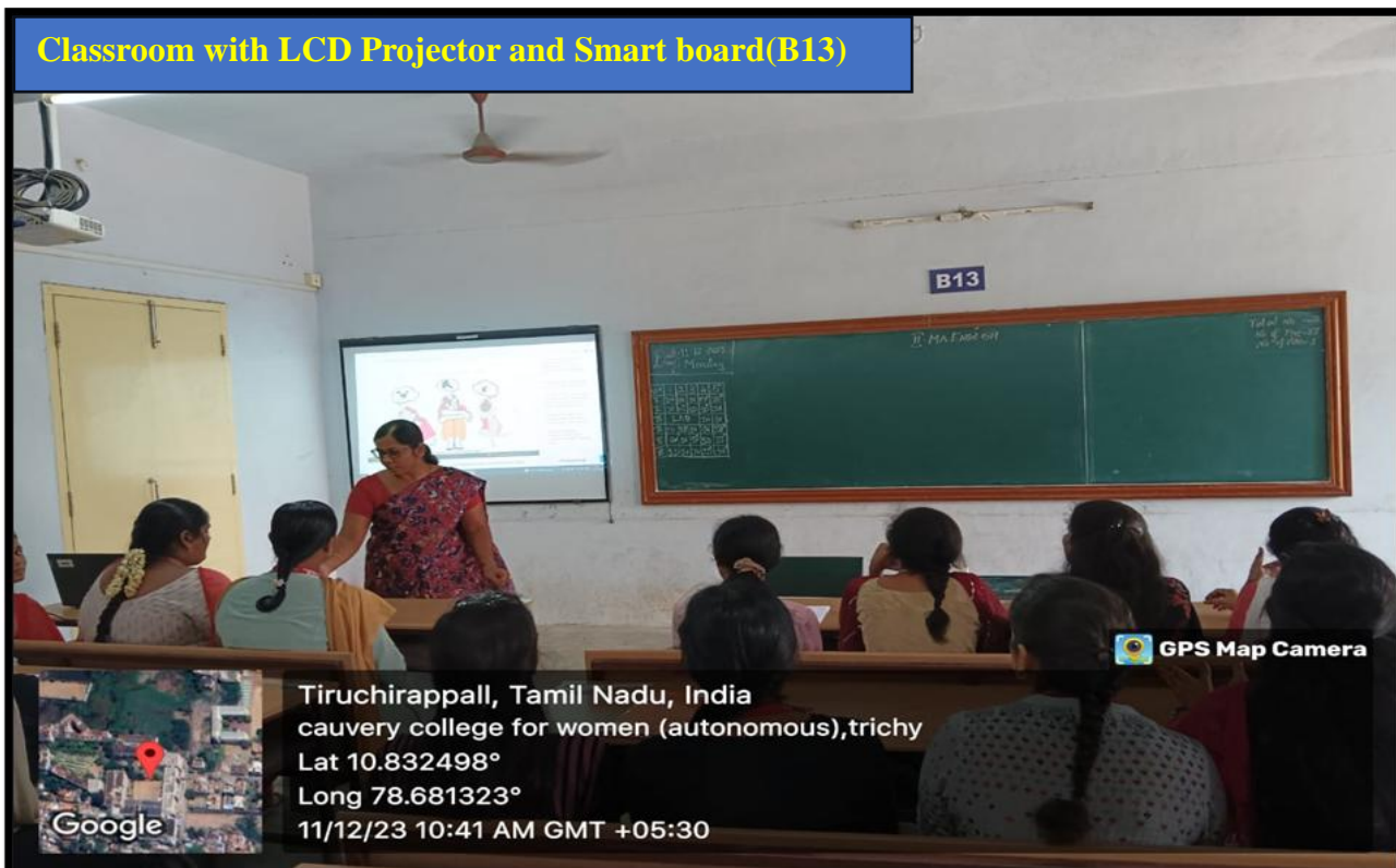
II MA ENGLISH