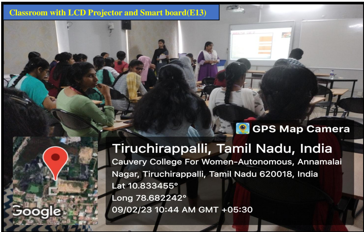
EDC MINI HALL